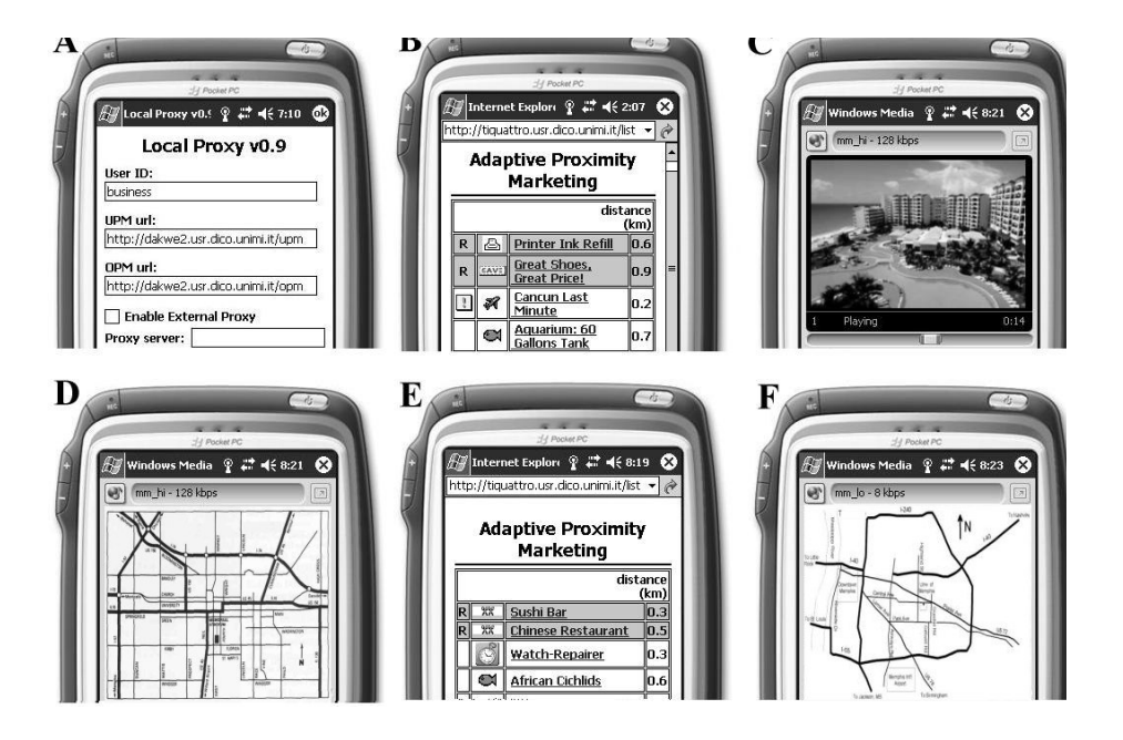
Figure 3. Some screen-shots of the web application prototype